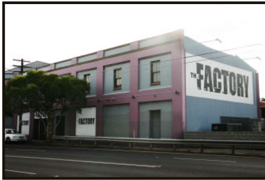
Factory Theatre Day

Sydney Underground Film Festival & Factory Theatre Logos available in standard (as shown) or reverse.