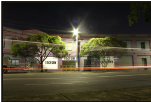
Factory Theatre Night